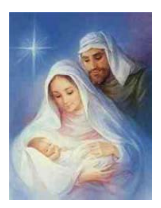
The Real Reason

Excitement and joy are filling the air; The lights add special decor. We're shopping for Christmas gifts everywhere, But are gifts what Christmas is for? The wreaths and the trees and the parties Aren't what we need to convey; It's the birth of our Savior, Jesus, The real reason for this holiday.